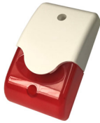
Combined Signaling Device 7940