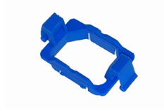
IEC Lock Clip 0861