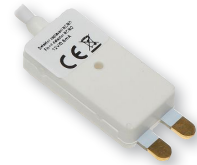
Leakage Point Sensor 7313