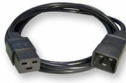
IEC C19 Extension Cable 0814