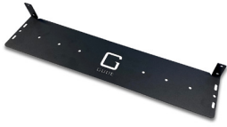
Desk/Wall Mount 0871