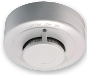
Smoke Detector 7311