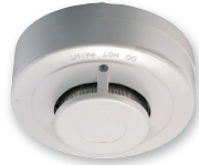
Thermal Fire Detector 7312