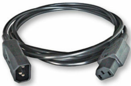
IEC C13 Extension Cable 0803, 0804