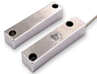
Door Contact Sensor 7950