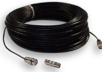
BNC Extension Cable 0134