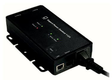
LAN and sensor port on the right side