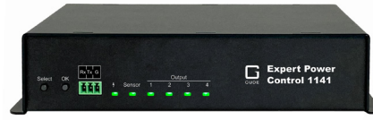
Front and back of Expert Power Control 1141-1 Robust and compact IP power distributor with 4 power ports