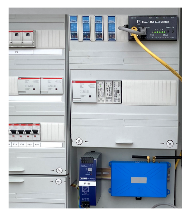
Expert Net Control 2302 in the switch cabinet (upper right), Photo: City of Monheim